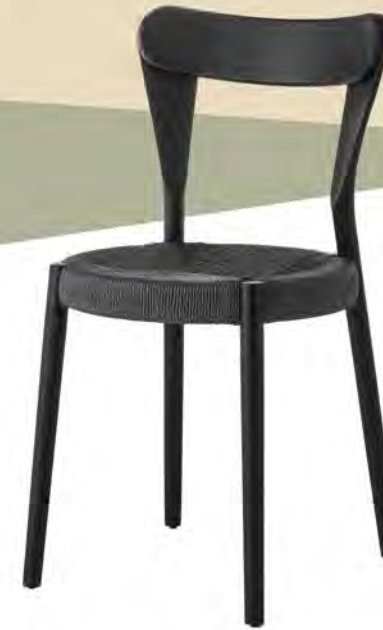
PAGAIA SIDE CHAIR

Finally, by choosing alternative seat options such as cane or natural rope, you reduce the use of polyurethane foam.